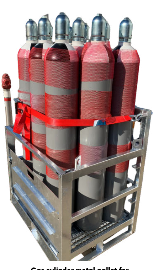
Gas cylinder metal pallet for 12x 50 liter gas cylinder with ramp

Types - Beside the old school pallets in gas or chemical industries we have our own developments for easier handling/storing or sometime for price reduction at low budget line. If you have your own design that is not a problem please contact us. https://pwent.eu/en/category/products/gas-cylinder-metal-pallet/