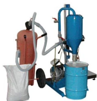
FILLING WITH "VENTURI" KIT