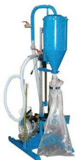
POWDER RECOVERY WITH ACC/ADA04 ADAPTER