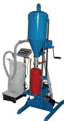
FILLING OF PORTABLE EXTINGUISHER