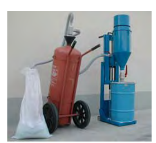
FILLING OF WHEELED EXTINGUISHER WITH VENTURI KIT