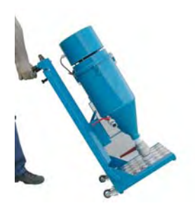
EASY TO BE MOVED