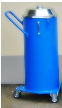
OPTIONS: POWDER RECOVERY TANK CONTAINER 110 lt average