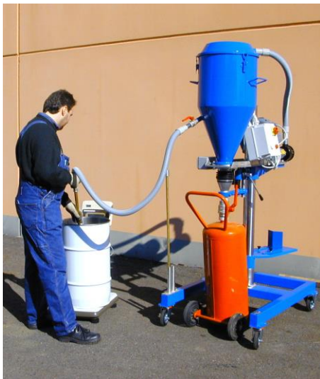
FILLING OF WHEELED FIRE EXTINGUISHER