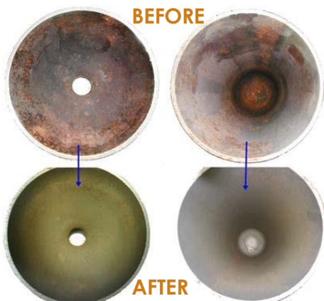
Cylinders before and after cleaning