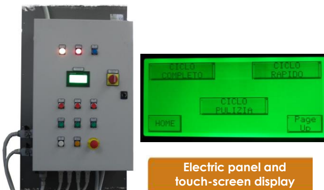
Electric panel and touch-screen display