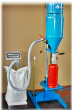
FILLING OF PORTABLE EXTINGUISHER