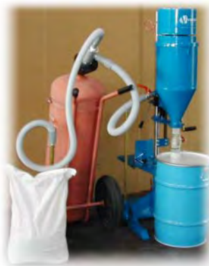
FILLING OF WHEELED EXTINGUISHER