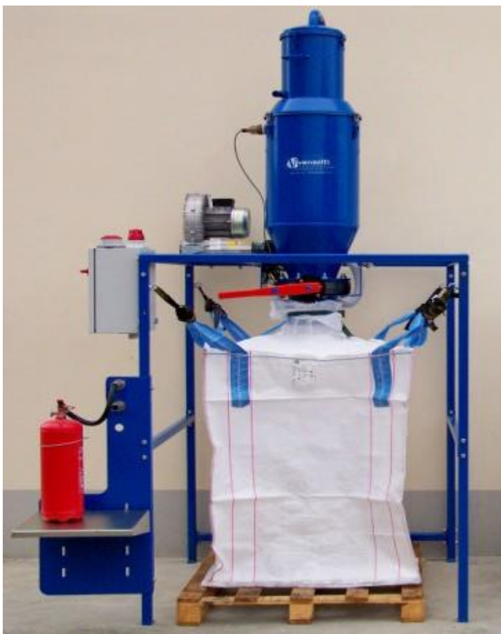
> Totem BAG model

The easiest dry powder recovery from fire extinguishers into BIG-BAG for disposal