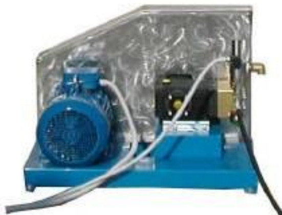
> N7/15 Detail