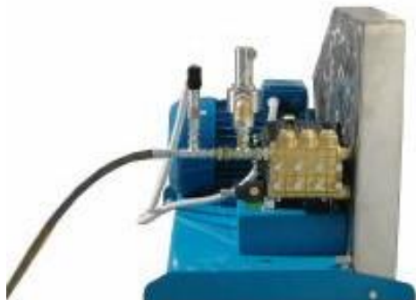
> N7/15 Detail