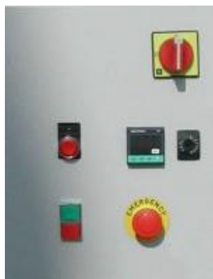
> Electrical panel