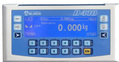
Detail of the scale display